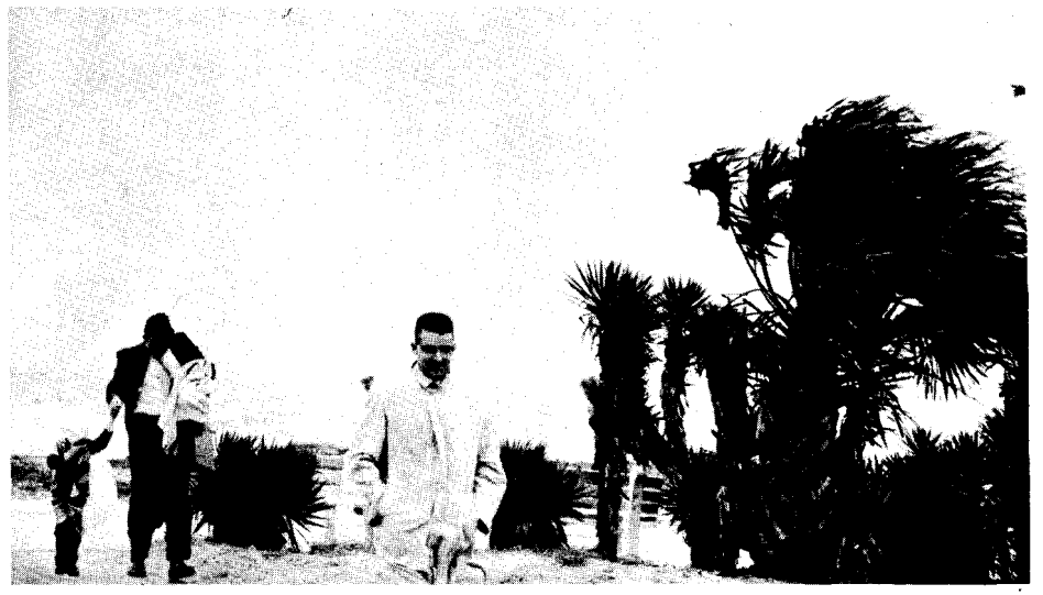
Several brethren brave the strong winds as they make their way back to their room following interruption of services at Jekyll Island last year.

There are also other examples of bad attitudes and disobedience, especially in our newer Feast site, Jekyll Island!