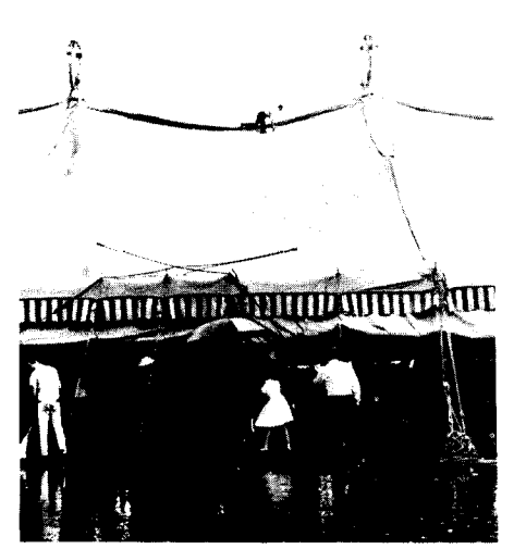
A hearty crew of willing hands heave ho battening down loose ends during a lull in the storm last year at Jekyll Island.

These are only a few of the incidents that occurred at the Feasts in Jekyll Island, Big Sandy and Squaw Valley. There are many other incidents of similar nature that occurred at Blackheath, Hayling Island, Fort-de-France, Merri-